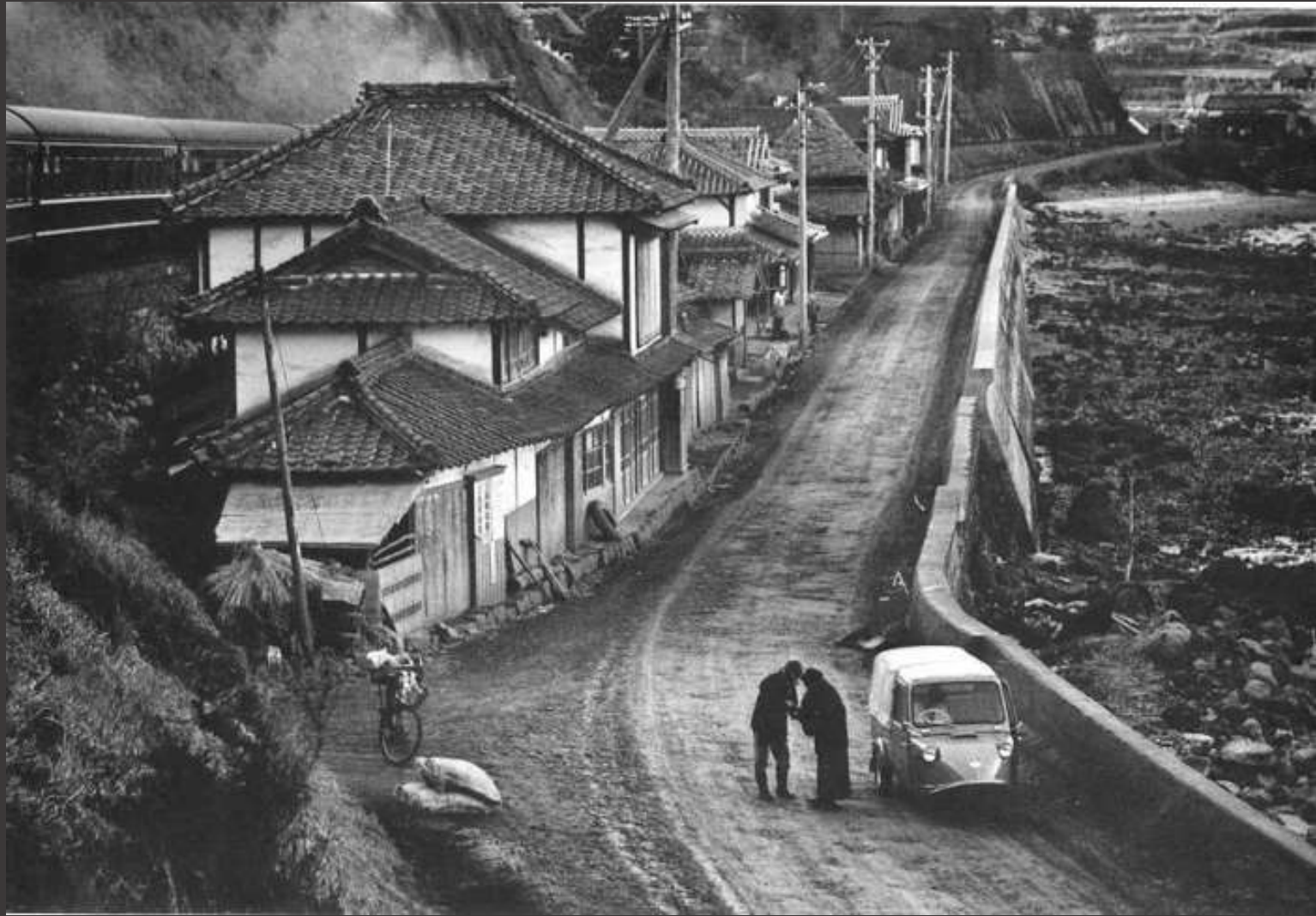
W Eugene Smith